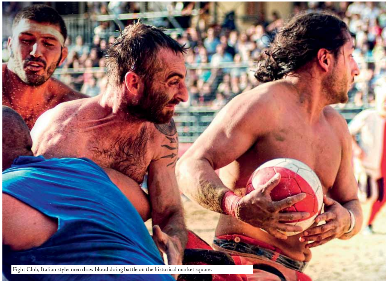
Fight Club, Italian style: men draw blood doing battle on the historical market square.